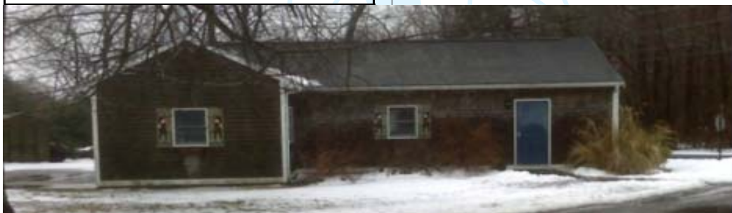
Site of OSCA's 2009 Dead of Winter Party